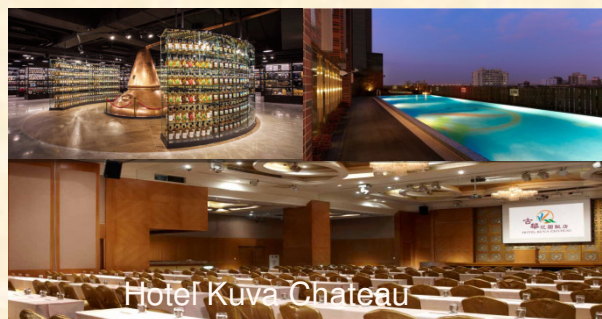
Hotel Kuva Chateau

All suggested hotels are located near to conference venue. Room reservation can be made directly to the respective hotels or other booking sites such as Agoda, traveloka, booking.com, trivago, etc at lower rate